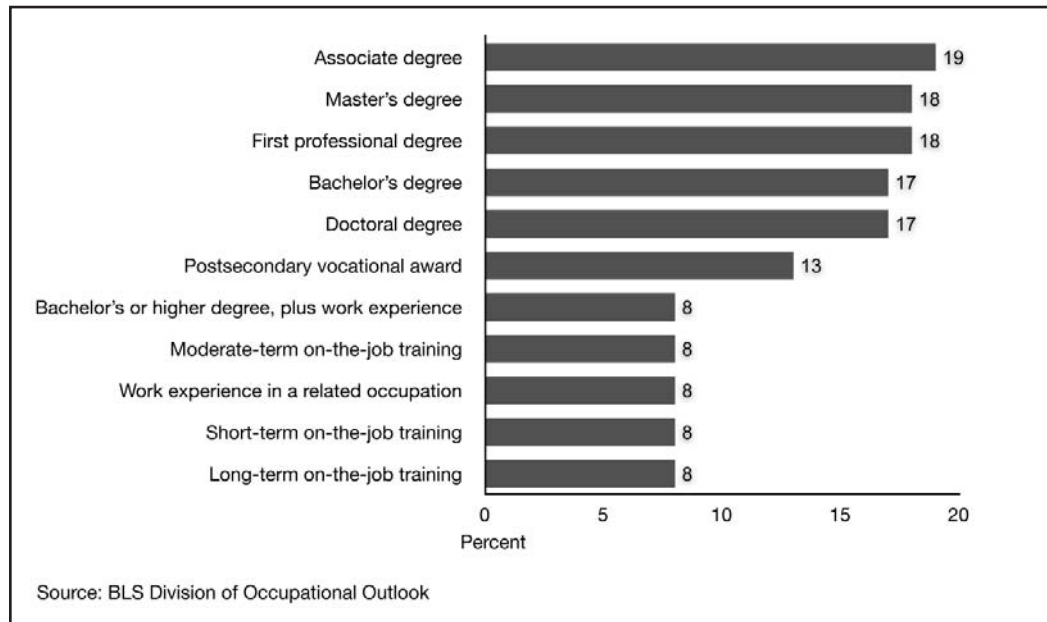
Figure 2: Percent change in employment, by education or training category, 2008-18 (projected)

Preparing our young people for this new economy will require major changes in California’s secondary and higher education systems. While older Californians are among the most educated groups of people in the world, Californians under 35 now rank near the bottom of other industrialized nations. Currently, 38.6 percent of adult Californians have some type of a college degree, putting the state 21 st among the U.S. in degree completion. For Californians under 35, the attainment level drops to 35.9 percent, moving California to 30 th . This decline is occurring primarily because of declining high school graduation and college-going rates; it does not yet take into account additional declines that will soon show up because of budget-related enrollment rollbacks and tuition increases.